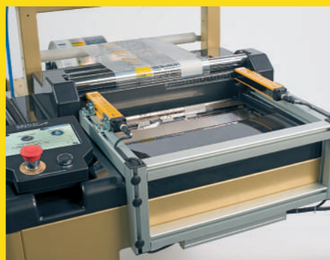
Cycle start by product insertion