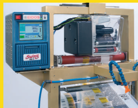
Thermal transfer printers