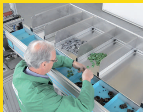
Collation table and conveyors